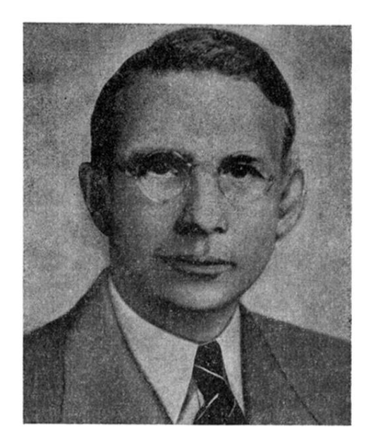
FIG. 3. Ernst Ising.